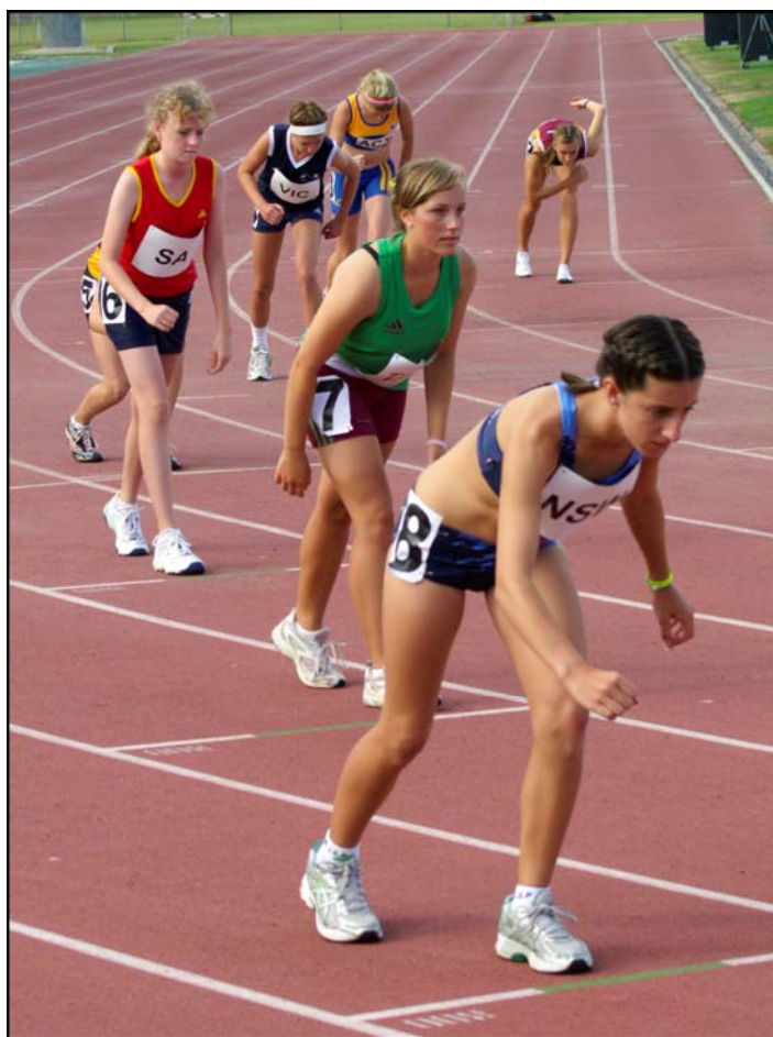
Little Athletes competing at the Australia Cup in Brisbane in February 2008. First integrated athletics competition between Australian Little Athletics and Athletics Australia.